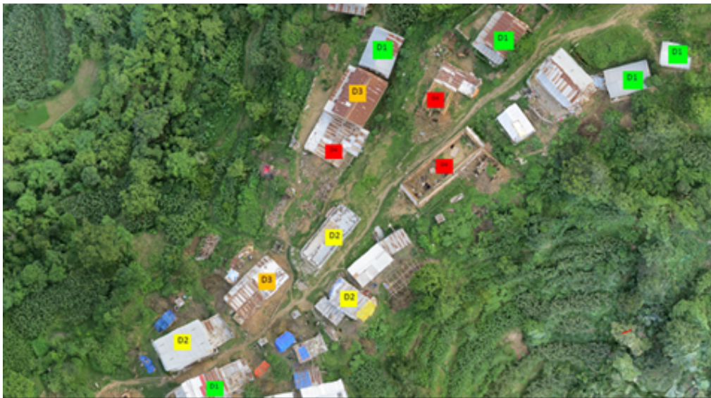
Figure 2. The Result of Orthomosaic Analysis

D4: Totally destroyed | D3: Largely damaged, cannot be recoverable D2: Partially damaged, can be recoverable | D1: Not damaged