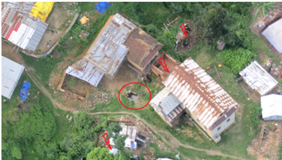
Figure 3. Mapped with the camera angle 75°

D4: Totally destroyed | D3: Largely damaged, cannot be recoverable D2: Partially damaged, can be recoverable | D1: Not damaged